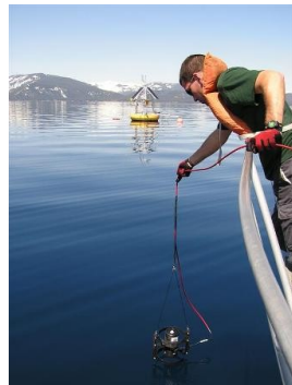
UV Radiometer in Lake Tahoe